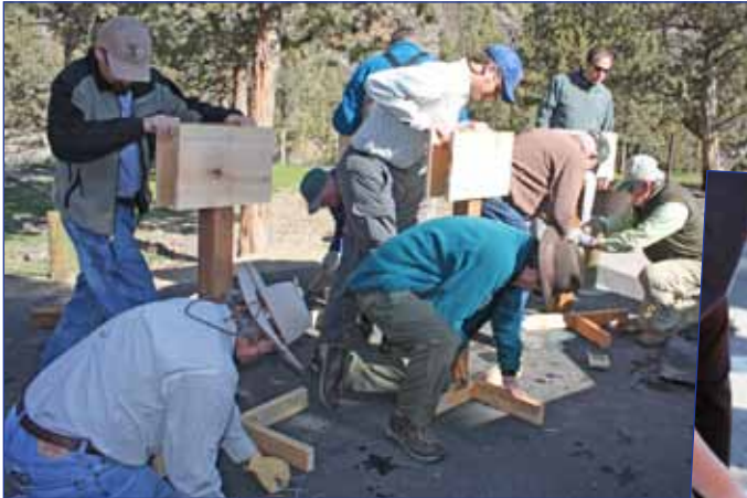
COF members, with assistance from Prineville High School students, assembled and placed educational signs along the Crooked River.