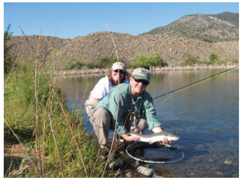
SUGAR CREEK RANCH

Announcing a new fly fishing clinic Just for women