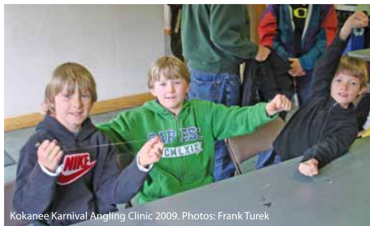
Kokanee Karnival Angling Clinic 2009.