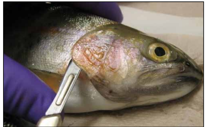
Examples of gas bubble disease in fishes.