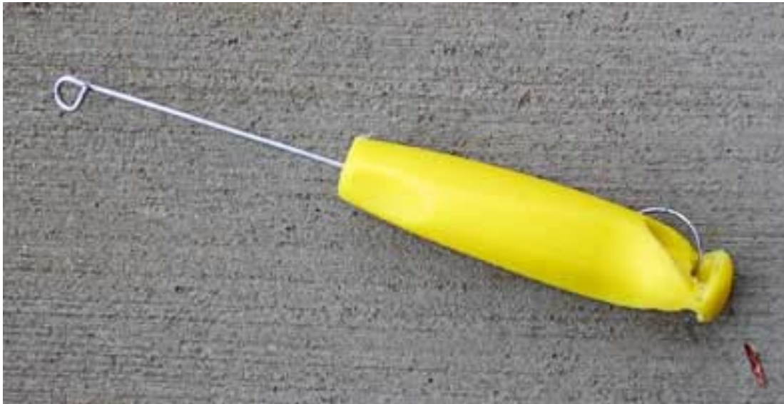
Catch and Release Tool