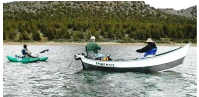
Frigid Fishermen, Haystack Reservoir