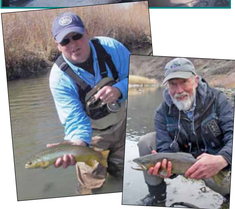
Owyhee River outing, March 2009.