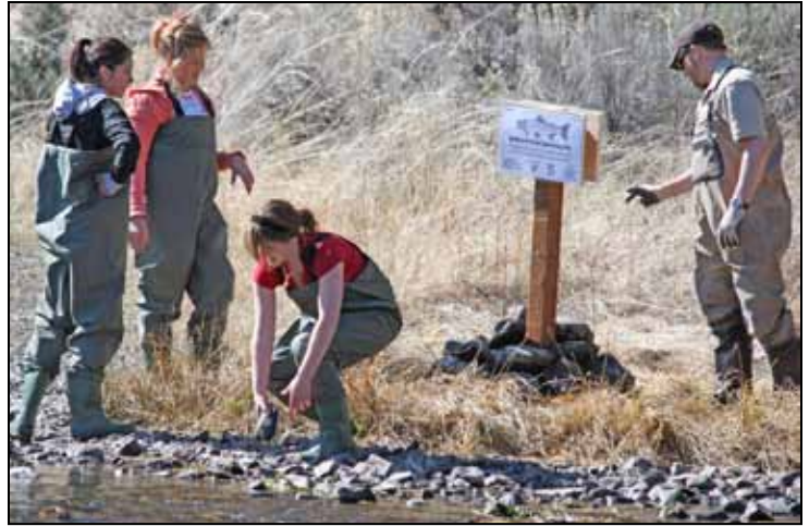
Students and volunteers installed signs near redband spawning areas on the Crooked River.