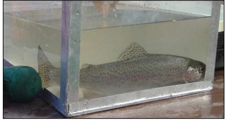
(top) Volunteers gather at Chimney Rock campground on Oct 6. (bottom) Measuring redband trout before surgery.