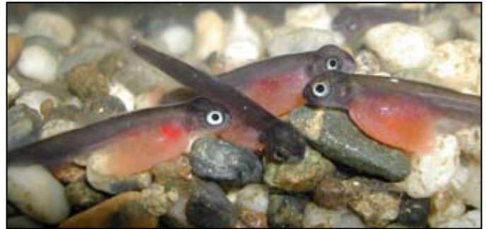
Alevin doing well at Vern Patrick.