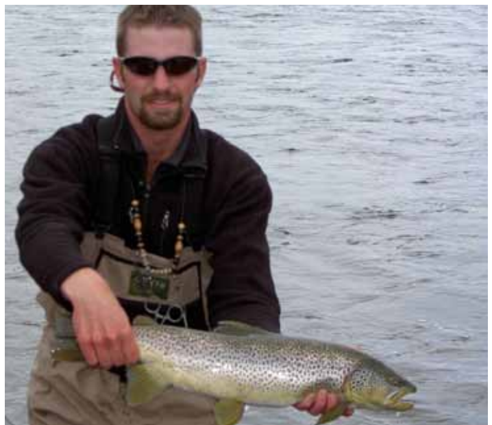
Fish caught on the Bow River Bugger.