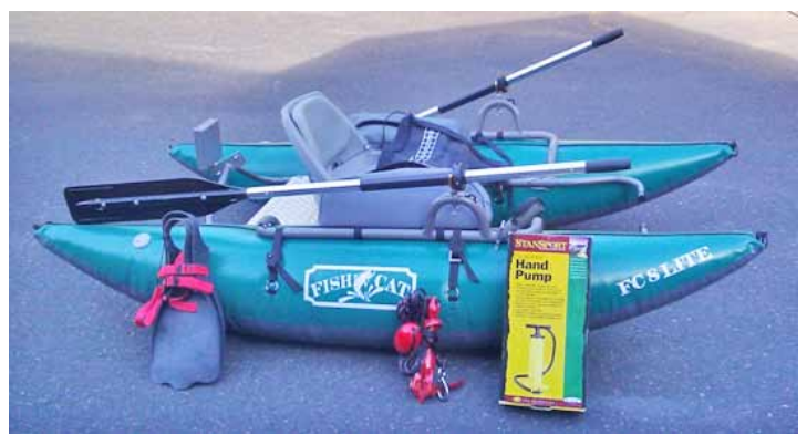
For a $10 purchase, you have the opportunity to win this Fish Cat pontoon boat and all the accessories.

Squares will be sold at the October meeting. If you cannot attend the October meeting but would like to buy a square, contact Debbie Norton (503-510-2767). We will draw the winning name once all the squares have been sold!