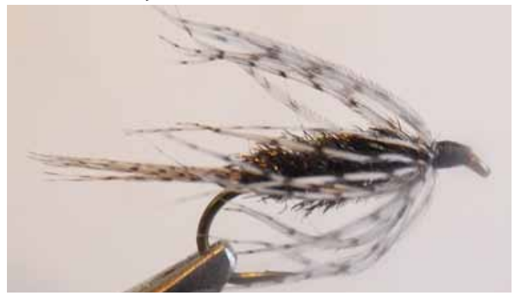
Thread: black or olive, 8/0 to 14/0 Hook: #16 to #10 wet fly hook

Tail: a few wood or lemon duck barbs, shank length Body: peacock herl from the tail feather (not the strung stuff) Rib: fine silver or copper wire