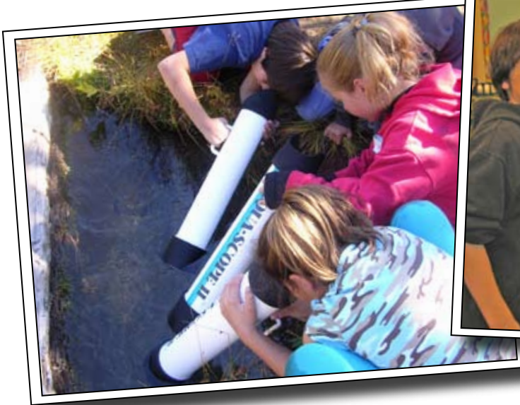
Students use aquaviewers at Brown's Creek to see what's happening below the surface.