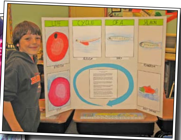
Student-made poster showing the life cycle of a salmon.