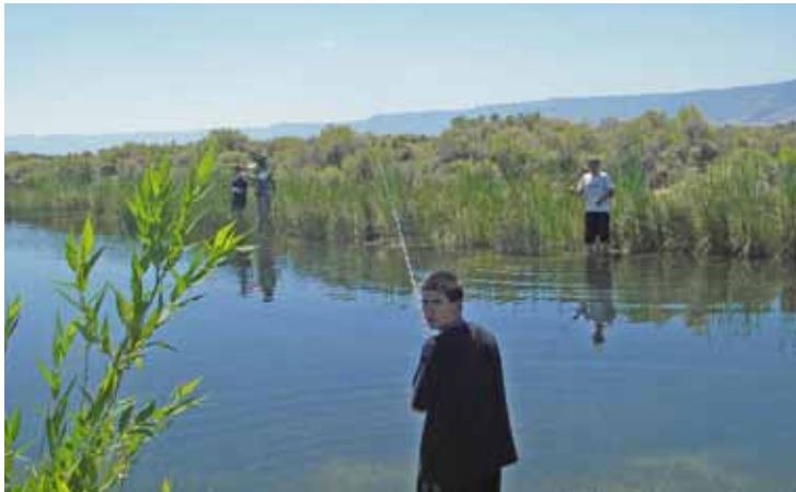
Fishing at one of the ponds at Edmunds Well.