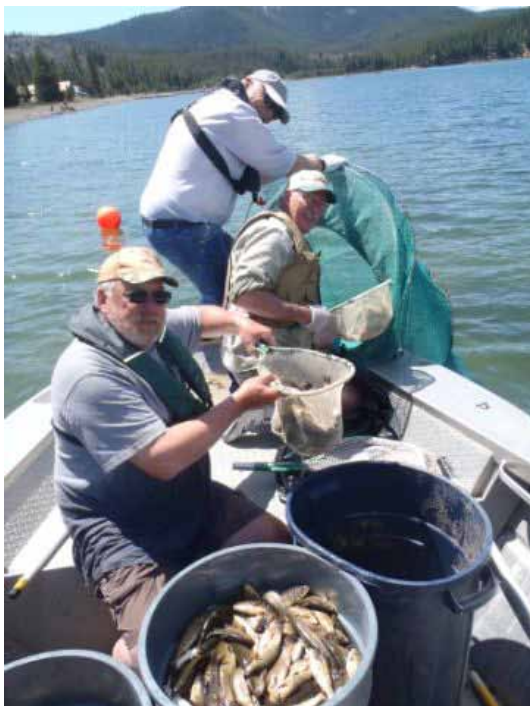
Collecting tui chub at East Lake, July 2010.